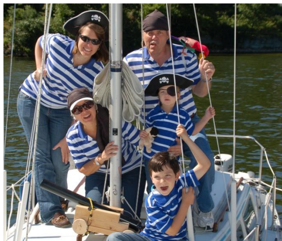
The Bluett Ship

The Bluetts and grandchildren even loaded a homemade cannon on board their cruiser, complete with recorded sound effects.